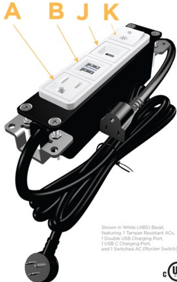
Shown in White (ABS) Bezel, featuring 1 Tamper Resistant ACs, 1 Double USB Charging Port, 1 USB C Charging Port, and 1 Switched AC (Rocker Switch).