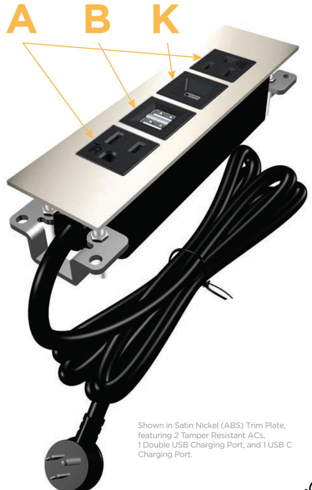
Shown in Satin Nickel (ABS) Trim Plate, featuring 2 Tamper Resistant ACs, 1 Double USB Charging Port, and 1 USB C Charging Port.