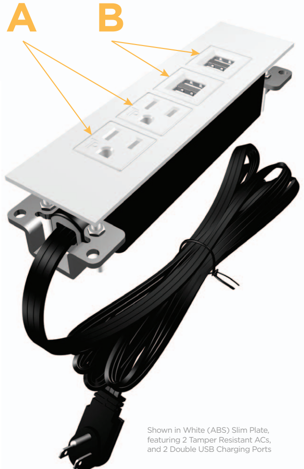
Shown in White (ABS) Slim Plate, featuring 2 Tamper Resistant ACs, and 2 Double USB Charging Ports