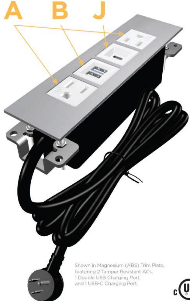
Shown in Magnesium (ABS) Trim Plate, featuring 2 Tamper Resistant ACs, 1 Double USB Charging Port, and 1 USB-C Charging Port.